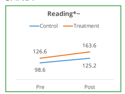
*p<.05; ~effect size>0.25